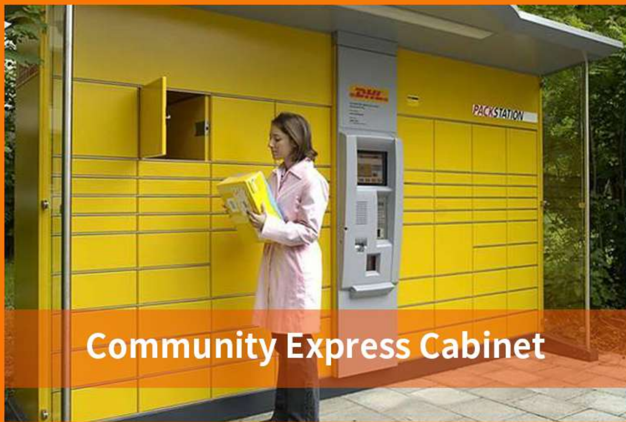
Community Express Cabinet