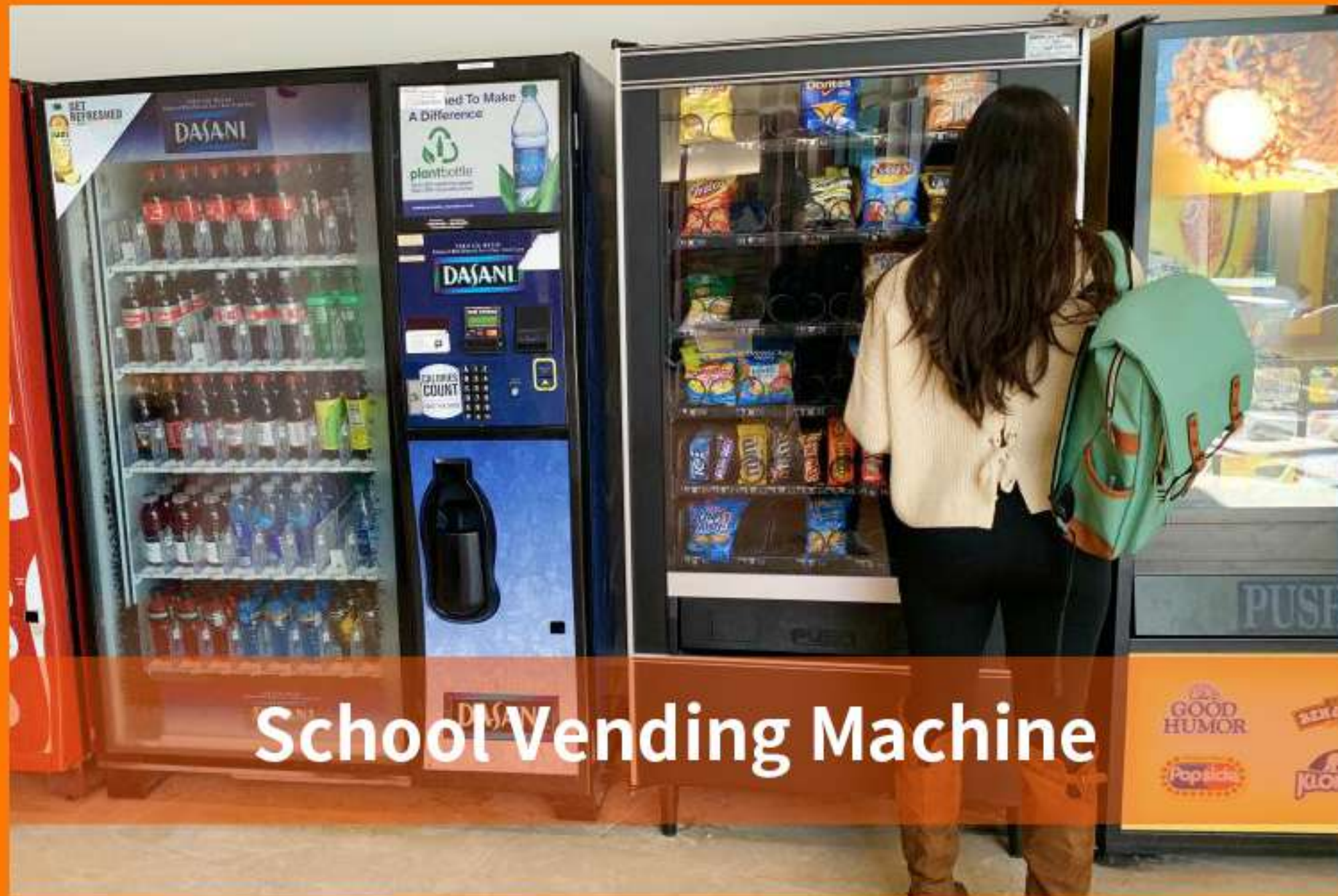
School Vending Machine