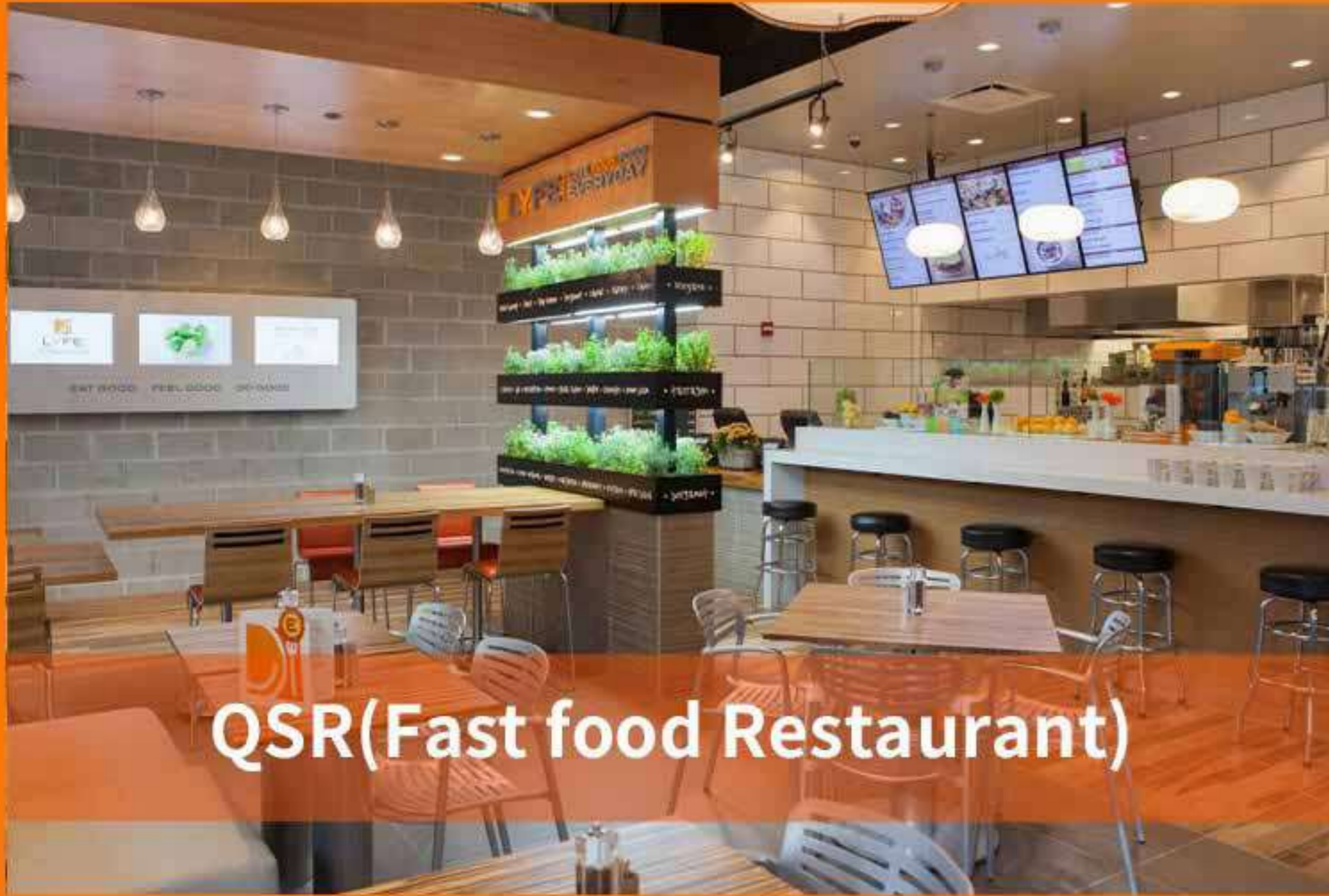
QSR(Fast food Restaurant)